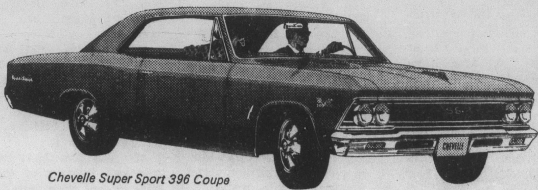
Chevelle Super Sport 396 Coupe

New 300's. New 300 Deluxe models. New Malibus. And two new Super Sport 396's—coupe and convertible—with engines that tell you exactly what kind of Chevelles they are. Both are available with 396-cu.-in. Turbo-Jet V8's, either 325 hp or 360 hp. And both come with special hood, grille, suspension, emblems, red stripe tires, floor-mounted shift. Twelve beautiful new Chevelles in all—and all as new inside as they are outside, headlamps to taillights.