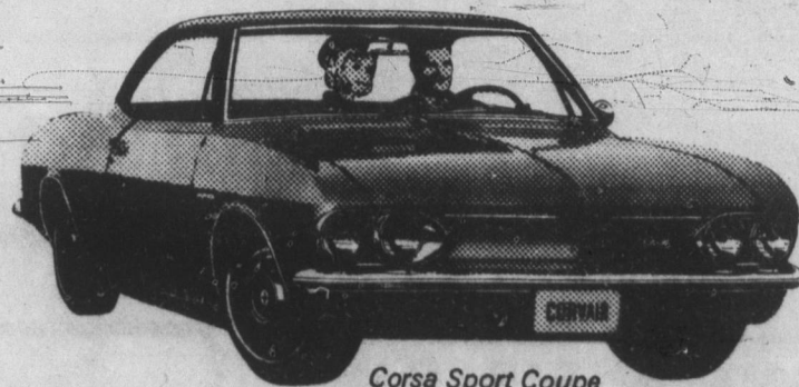
Corsa Sport Coupe