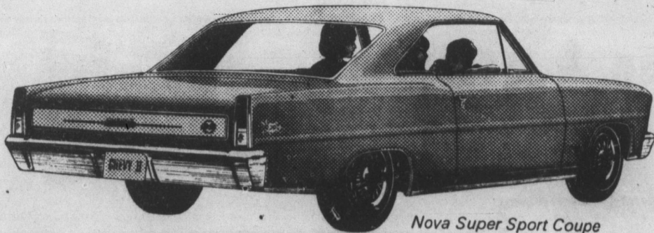
Nova Super Sport Coupe