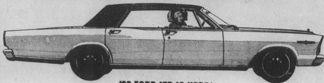
'66 FORD LTD IS HERE!

Quiet quality! Ford could be the world's quietest car. All the better to hear Ford's new stereo tape player option!