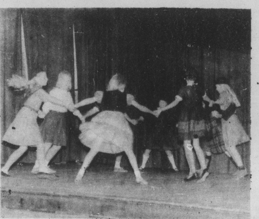
Celo Girl Scout Troop 19 in a Hungarian Folk Dance