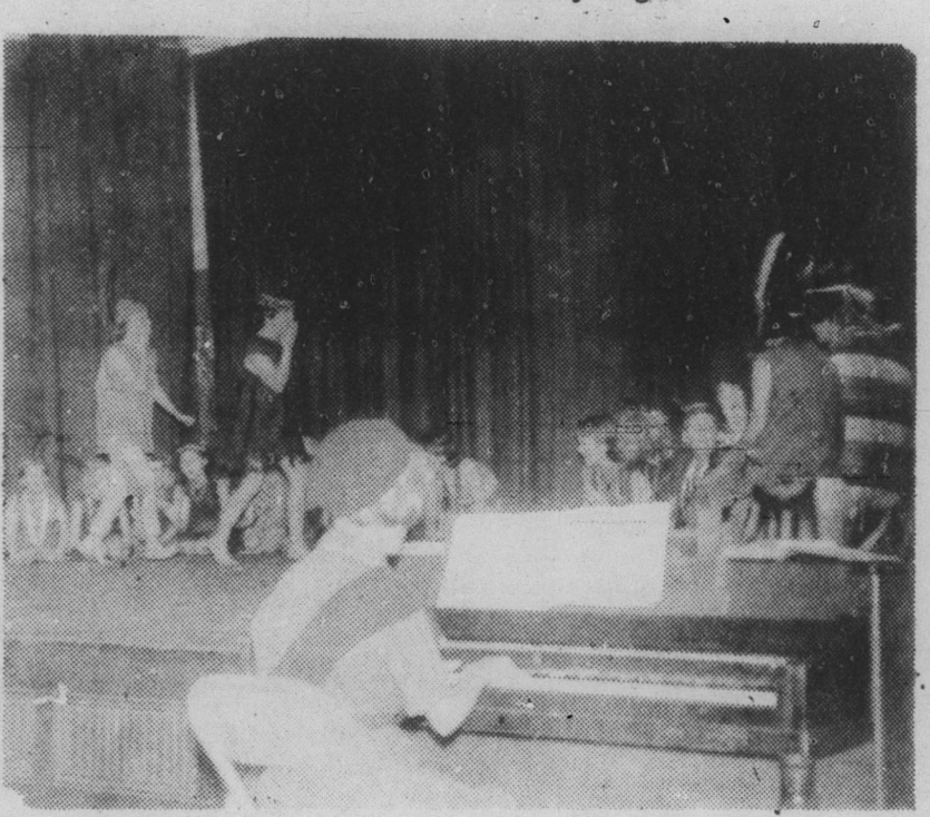
The Junior Girl Scout to Little Beaver" at the Troop 88 in a skit 'Leave it Scout program.