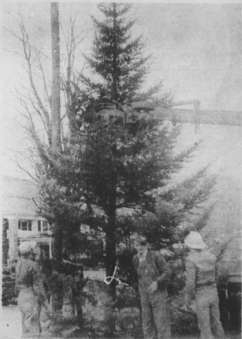
Employees of the French Corporation installing the Broad Electric Membership Christmas tree on the square

GIFT WRAPPED FREE ANGLIN & WESTALL Burnsville, N. C.