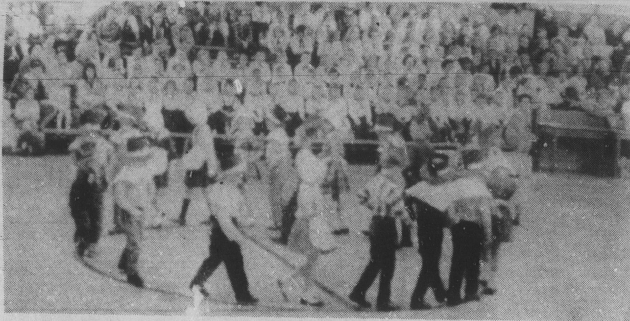
A dance scene from the Harvest Festival held at the Burnsville Elementary School here Friday night.