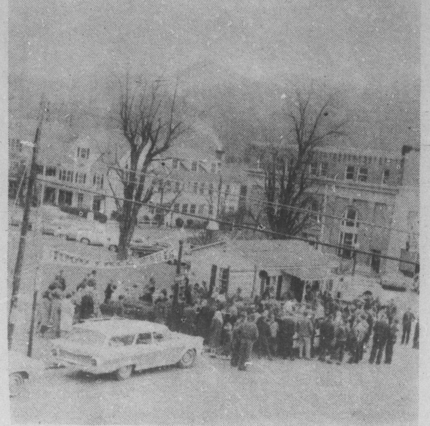
A group gathers near the Chamber of Commerce Building on the Town Square