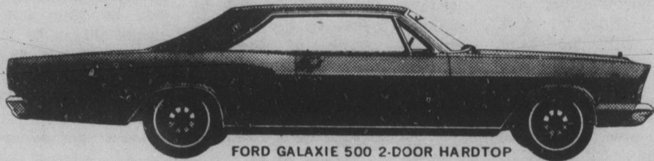
FORD GALAXIE 500 2-DOOR HARDTOP

Ford is No.1 in Sales in the Carolinas. There's gotta be a reason!