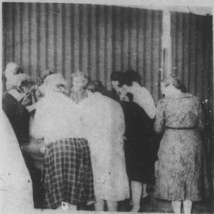
Women hard at work at W.A.M. Y. office learning to make "Red Riding Hood" dolls.

Yancey County may have a farmer's market soon if the goal is met that is being worked on now.