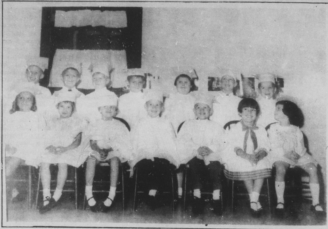
Shown above are members of the graduating class and Marshals of the Kindergarten graduation held in the First Baptist Church here Monday night. They