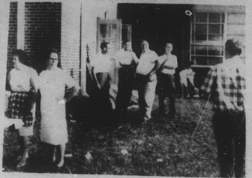
Some just talked

Such a get-together is doubly enjoyable because it represents a story of things that did not happen: eye, back, leg or hand injuries; hospital, and other bills that it was not necessary to pay; and, most importantly, suffering and pain that was not experienced. These are really the benefits of such a picnic.