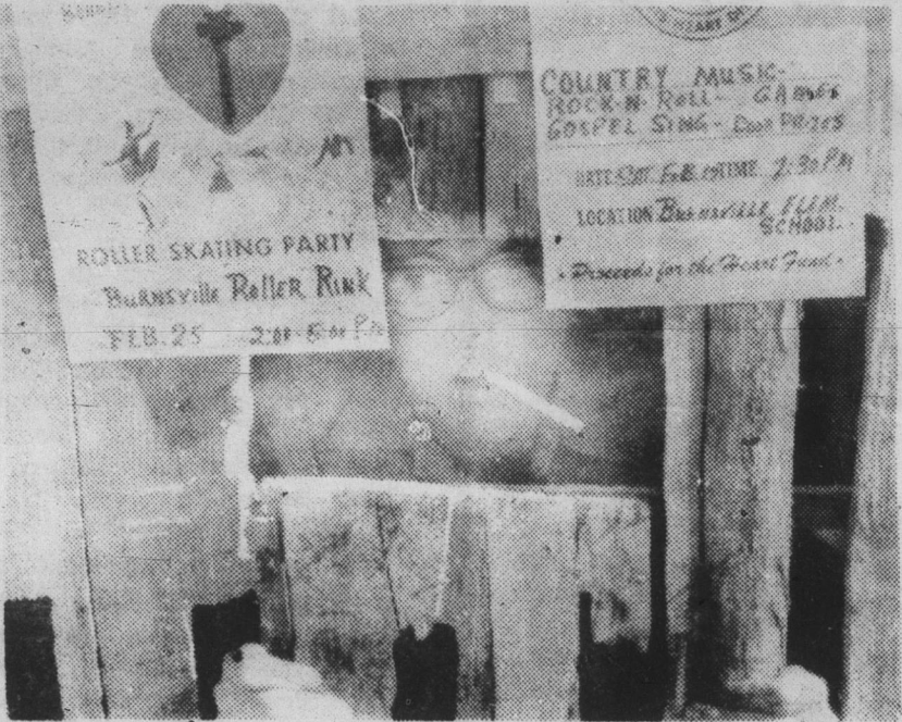
Jimmy Douglas of Radio Station WKYK takes time out to smoke a cigarette between pleas broadcast for "bail" to

According to McClure, other activities will be held here and in other parts of the county during the month to reach the goal of $1,200 set for this county for the Heart Fund.