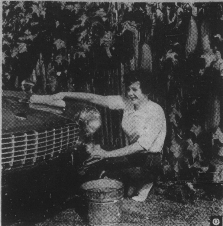
These big gourds yield big sponges when fully grown and treated to a water bath. Many people like their coarseness for rub-downs; others prefer to use them for the car.

Look well at the sponge with which the young lady is cleaning her car, noting especially its unusual shape. Then cast your eye on the fruits of the gourd vine growing up the fence. Those fruits, dried and with rind and seeds removed, furnished the sponge!