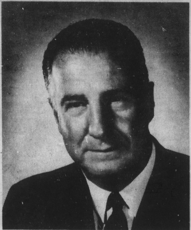
Spiro T. Agnew