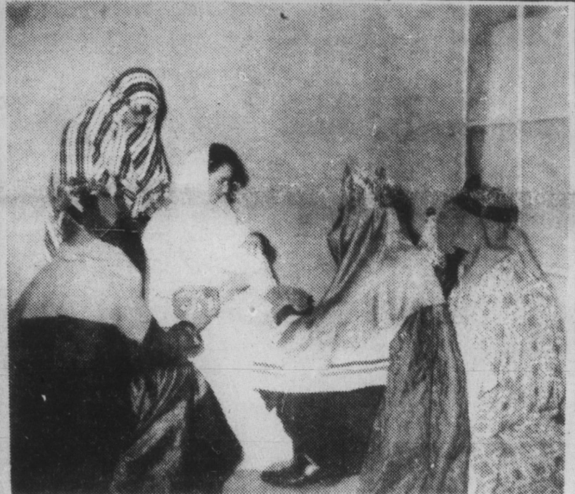
Scene from Uncle Ben's dream- Visit of the Wise Men