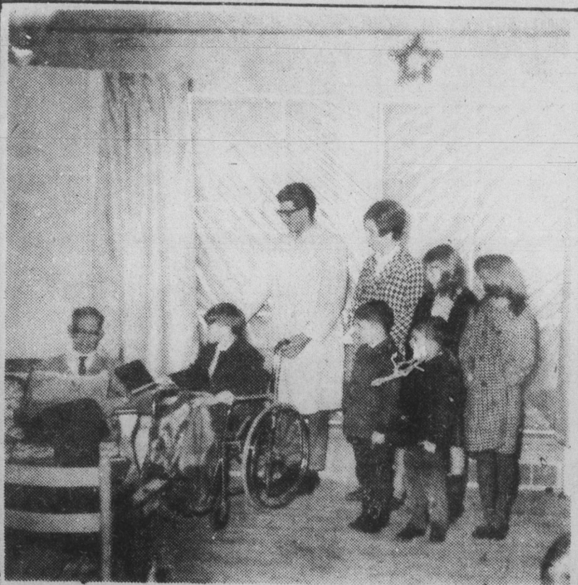
Grouchy Uncle Ben refuses to attend Christmas program