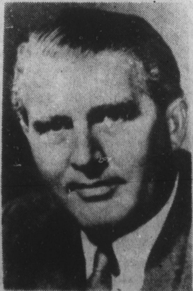
Dr von Braun

Under Dr. Von Braun's direction, the Marshall Space Flight Center group has several "firsts" in space, including the first nose cone of a ballistic missile to re enter the atmosphere from space; first primate to journey into space (monkeys Able and Baker); and the launching of Explorer I, the first U. S. earth satellite.