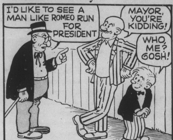
SEE! THAT'S WHAT I MEAN! I LIKE A MAN WHO IS HUMBLE AND NOT EGOTISTICAL!