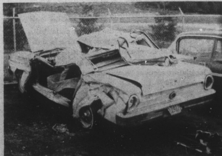
Car Demolished In Accident

England, the 33 year old driver of the truck, reportedly was not injured.