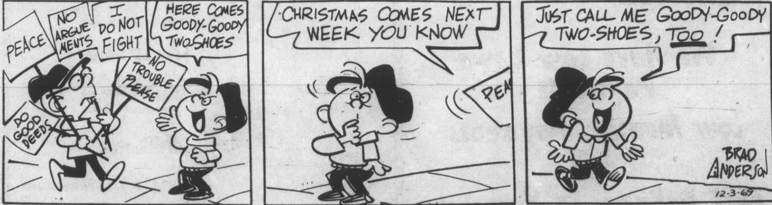
THOSE WERE THE DAYS