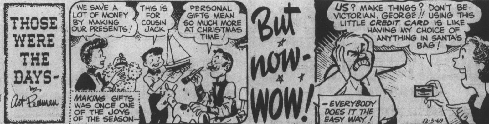
By ART BEEMAN