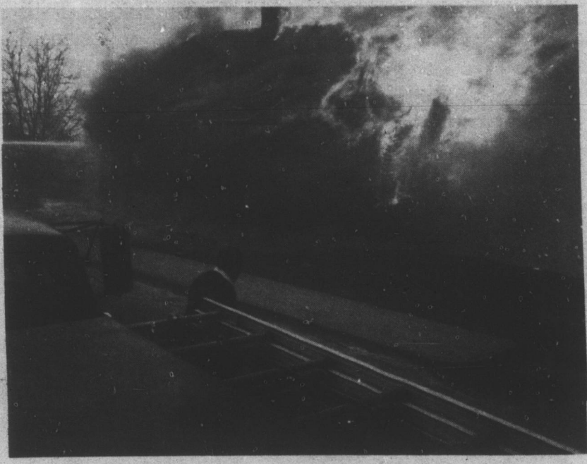
Dwelling Completely Enveloped In Flames

The blackened, ruined timbers framing the house are all that is left now of the Mitchell dwelling. Ironically, the ruin stands next to the site where another similar dwelling was destroyed by fire more than a year ago. The ruin stood for many months as a bleak reminder of fire's terrible capabilities until it was finally razed last summer as a hazard and an eyesore.