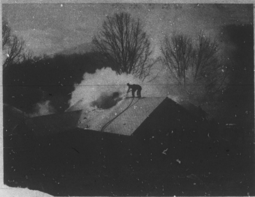
Inside Of Home Gutted By Fire