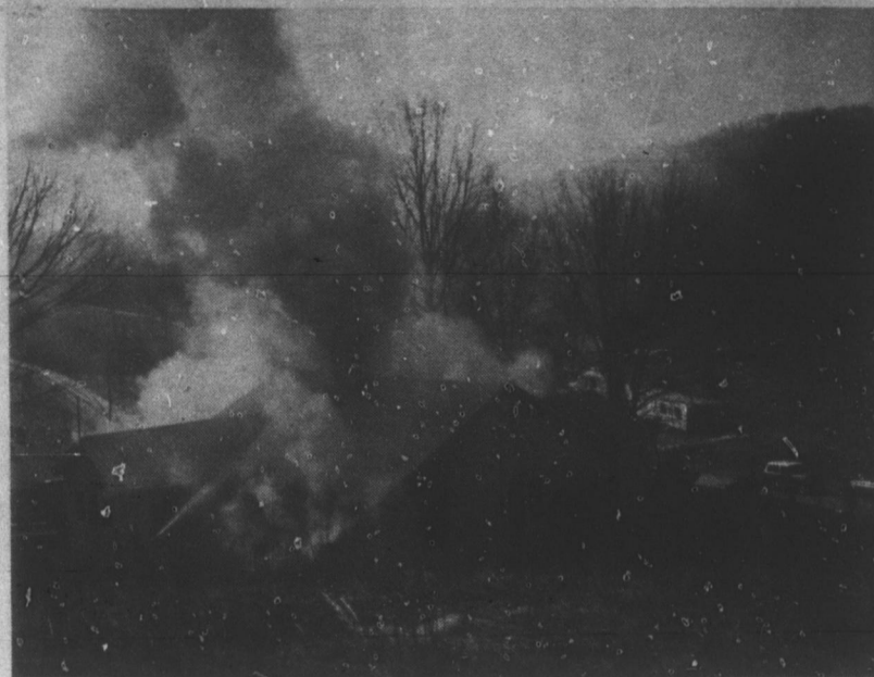
Burnsville Fire Dept. Fights Blaze