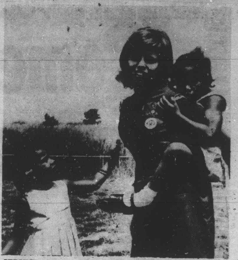
SERVICE IS A WAY OF THINKING. Girl Scouts each year give hundreds of hours of service to children of migrant workers, in Colorado, New Mexico, Michigan, Florida, Delaware and other states where migrant laborers work. Among other duties, the "girls-in-green" act as English tutors, teach crafts and put together libraries to help youngsters with their reading.

After 21, common Kidney or Bladder Irritations affect twice as many women