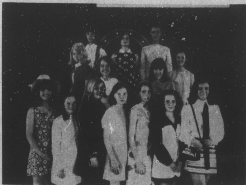
Cadette Scouts Present Fashion Show