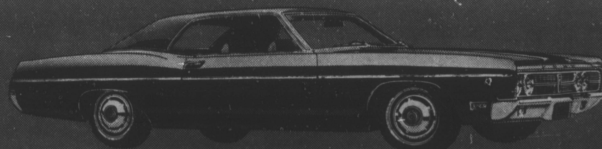
Special Galaxie 500—specially equipped and specially priced.