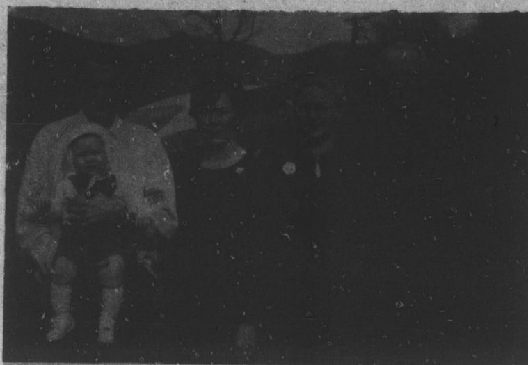
"Five Generations For Family Reunion"

More than 25 people attended the Family Reunion.