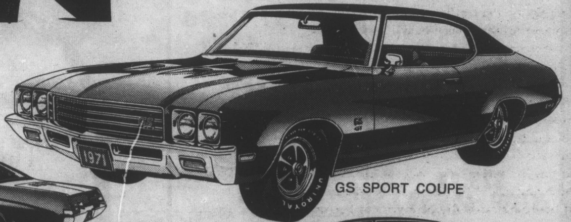
GS SPORT COUPE