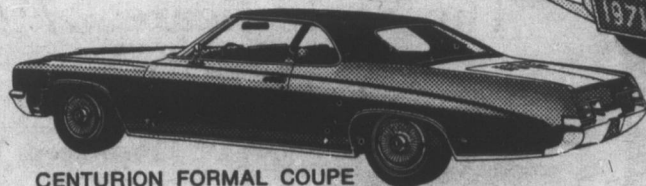
CENTURION FORMAL COUPE