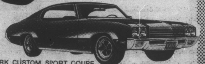
SKYLARK CUSTOM SPORT COUPE