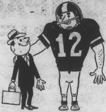
FOLLOW THE PROS

A social hour was enjoyed by the fifteen members present and four guests.