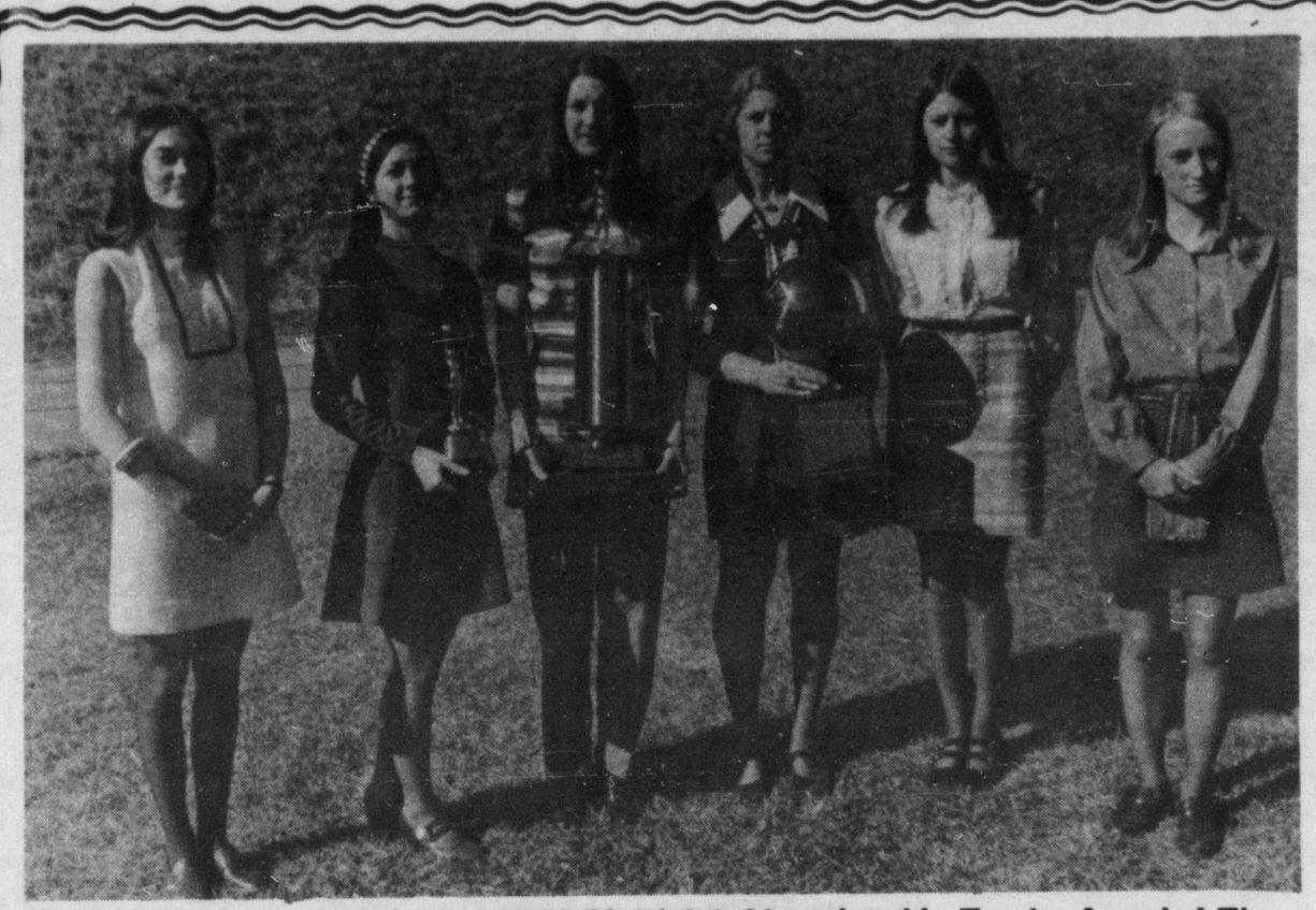
East Yancey's Lady Panthers Hold District 8 Championship Trophy Awarded Them

The new building is being paid for under one of the Federal programs aiding education. Obtaining this new building is a further example of the success of the county's school authorities in taking advantage of the various Federal and State programs. The source of this