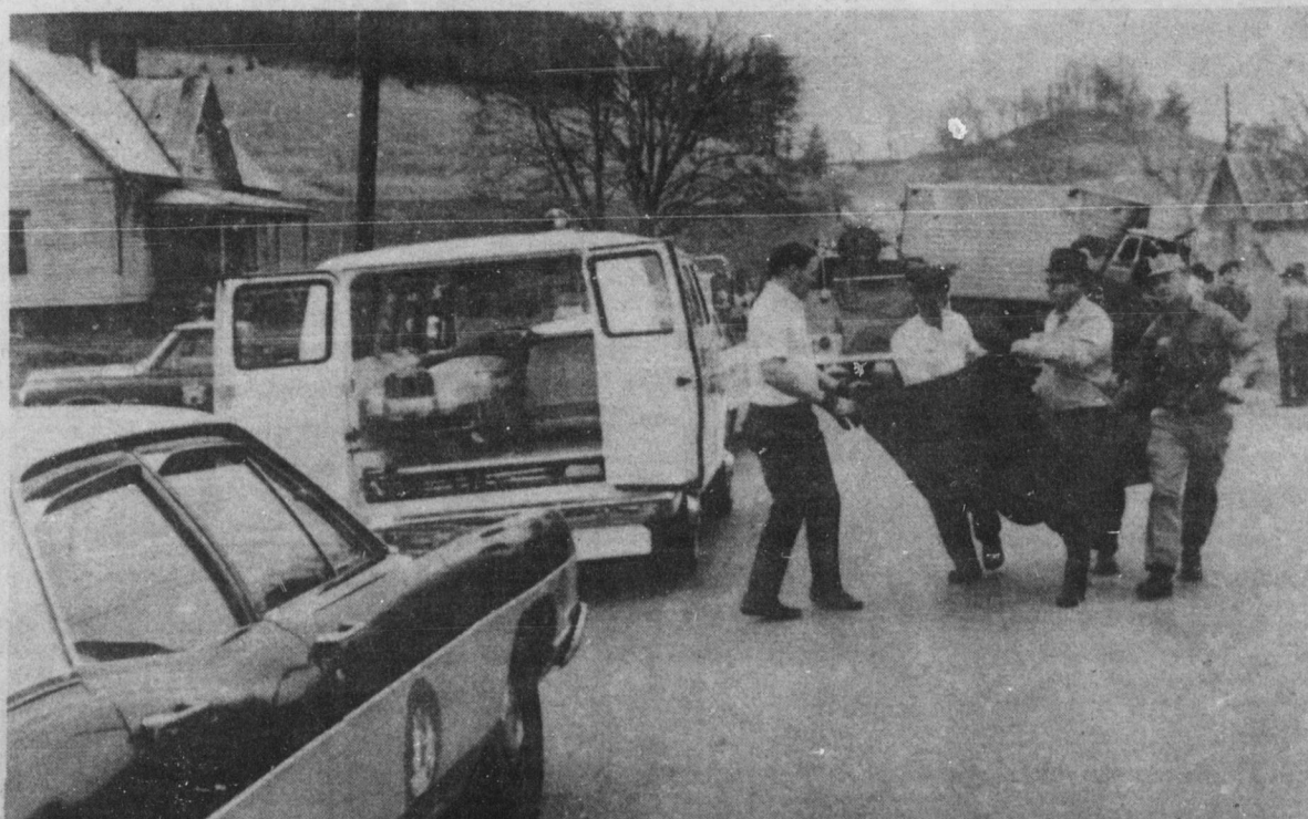
Volunteers Remove Bodies After Fiery Collision