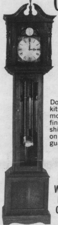
Model 120 Black Walnut