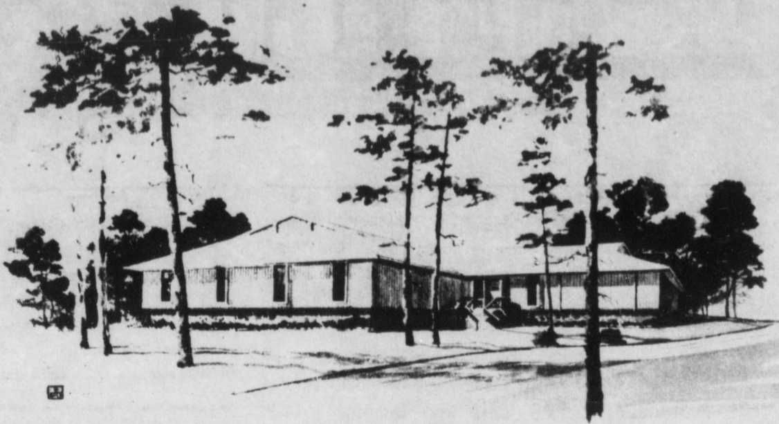
Artists Conception Of New Avery County Public Library