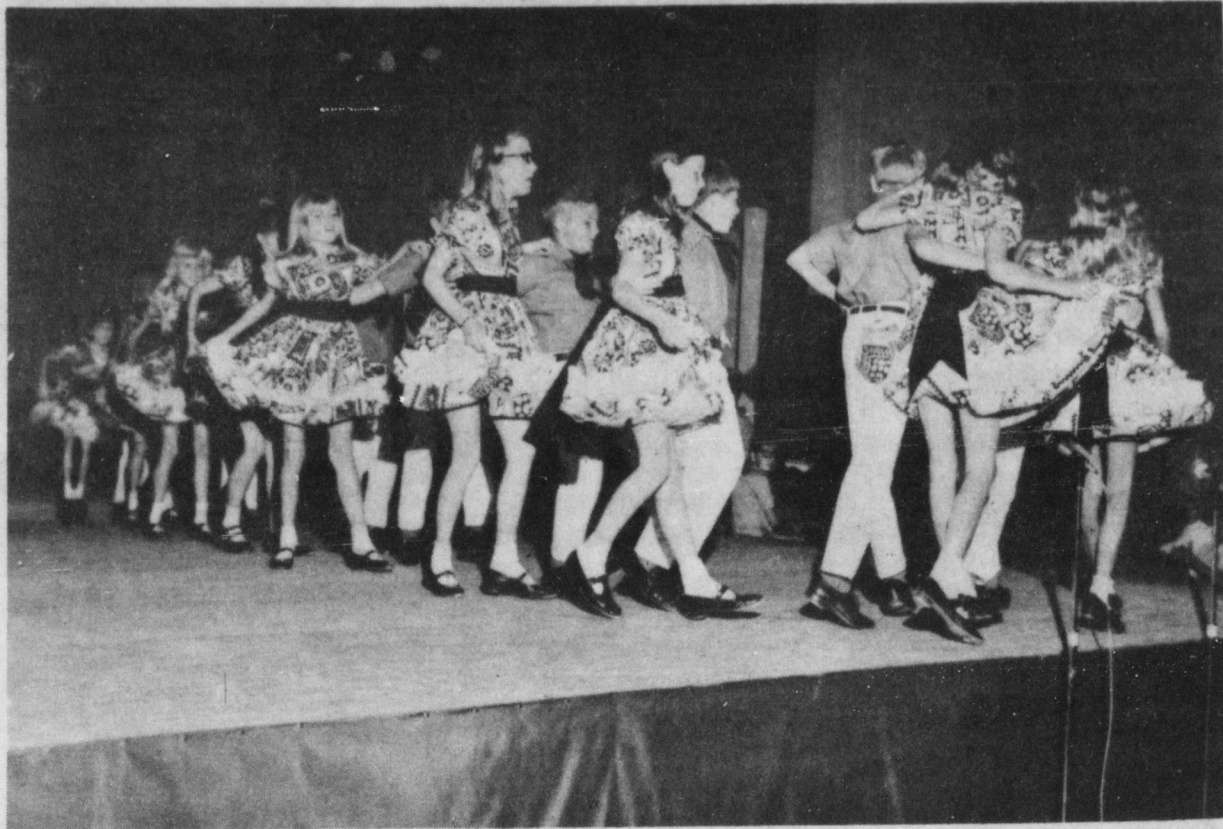
Cloggers Will Perform At 4th Annual Yancey Youth Jamboree To Be Held This Fall