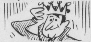
When he became Emperor of France - Napoleon crowned himself.

The CHILDREN'S HOUR will resume its regular schedule on Monday, June 28th at 10 a. m. and at 3 p. m. in the Yancey County Public Library.