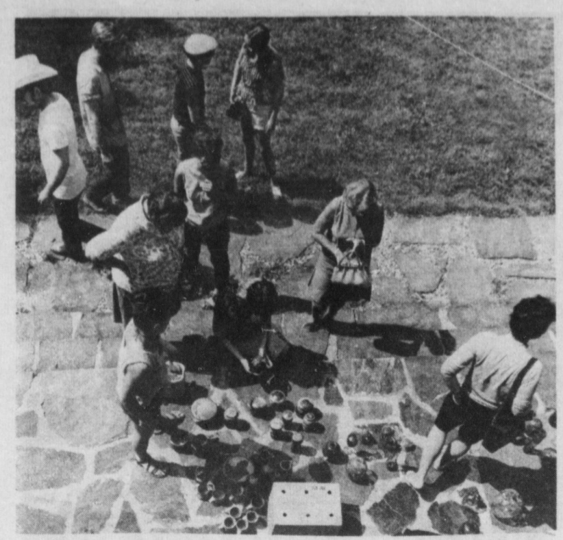
Craftsmen At Penland School Ply Their Crafts