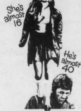
It may be love... but it's definitely exhausting!