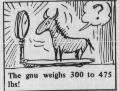
The gnu weighs 300 to 475 lbs!

Last year 301,000 people visited Oz, setting a record for North Carolina attractions. Paid attendance this year to date is 33 per cent over that of last year.