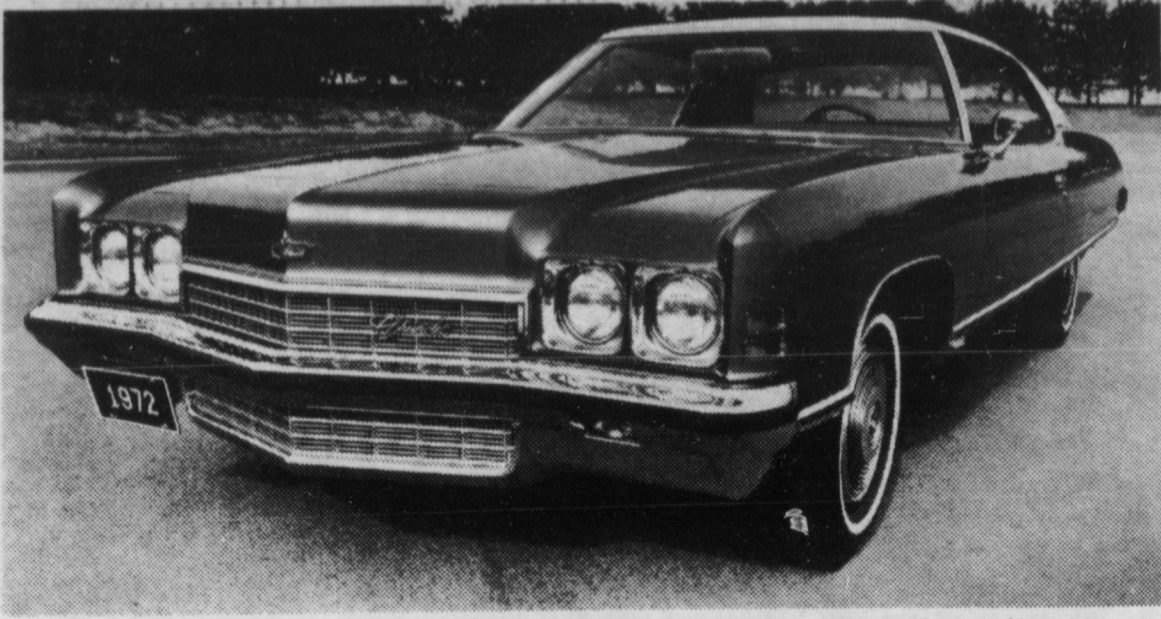
The 1972 regular Chevrolets have added distinction plus strong emphasis upon quality. There is a new squared-off look to the front with a lower grille and individualized headlights. This luxury Caprice has a special large grid grille, full length side moldings with a color insert plus exclusive interior appointments. All regular Chevrolets have stronger front and rear bumpers. Variable ratio power steering and power brakes with front discs are standard. Turbo Hydra-matic transmission is standard on regular V8 models. Introduction date for all 1972 Chevrolets will be Thursday, September 23.