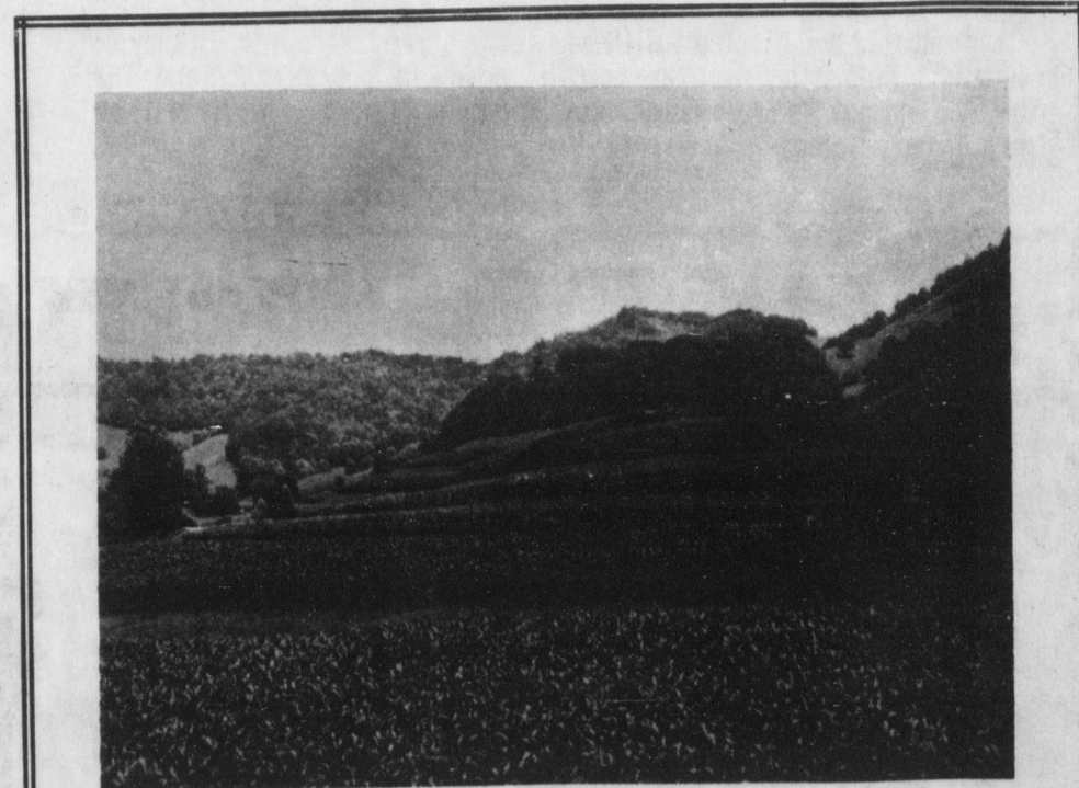
Strip Cropping - Corn, Tomatoes, And Grass Rotation

After 21, common Kidney or Bladder Irritations affect twice as many women as men and may make you tense and nervous from too frequent, burning or itching urination both day and night. Secondly, you may lose sleep and suffer from Headaches, Backache and feel old, tired, depressed. In such irritation, CYSLEX usually brings fast, relaxing comfort by curbing irritating germs in strong, acid urine and by analgesic pain relief. Get CYSLEX at drug-gists. See how fast it can help you.