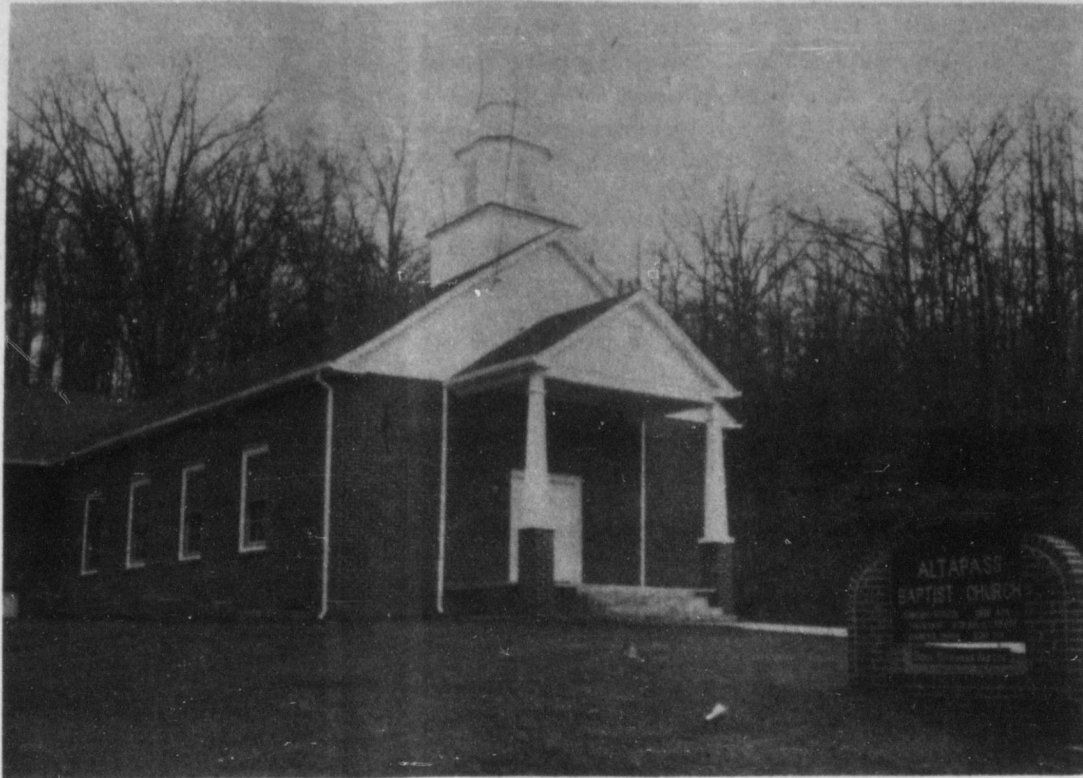
Altapass Baptist Church