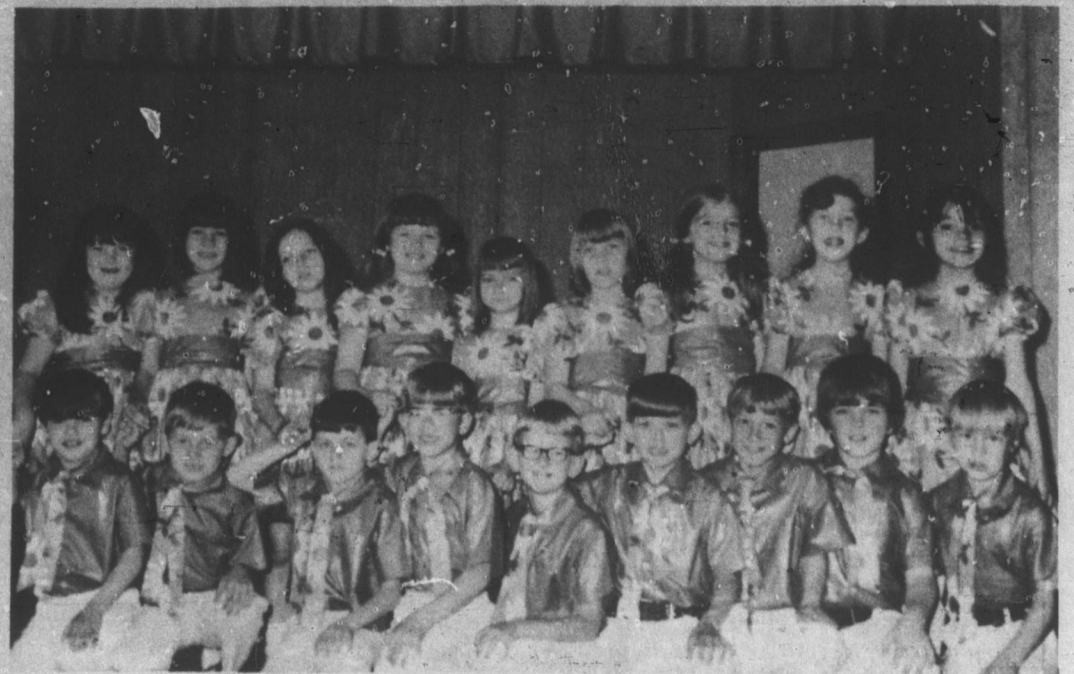
South Toe Mountain Doers