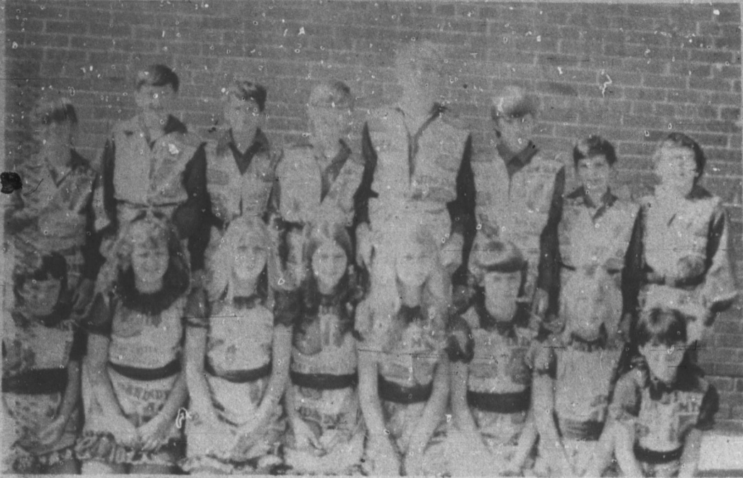
Smooth Square Dance Team