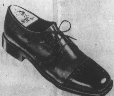
Brown & beige Mod-tique