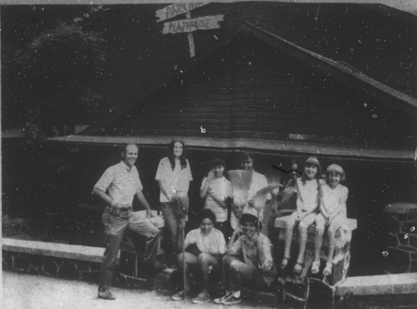
The "Clean Up" Crew Arrived Early At Parkway Playhouse This Year—Season Opens June 28

WKYK RADIO P. O. Box 744 — Burnsville, N. C. 28714 Phones: (704) 682-3510, 682-3798 24 Hour Weather Line 682-6400