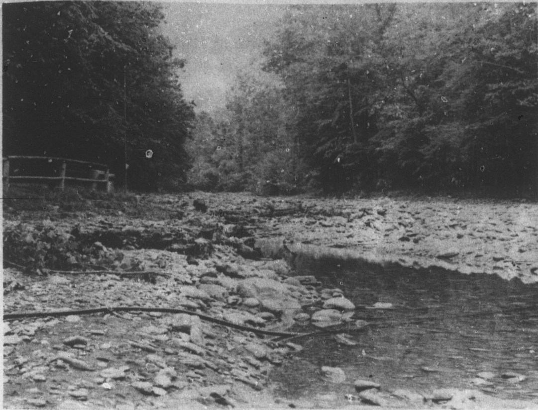
This Area Of Mt. Wilderness Was A Road Through Campground Before Flooding