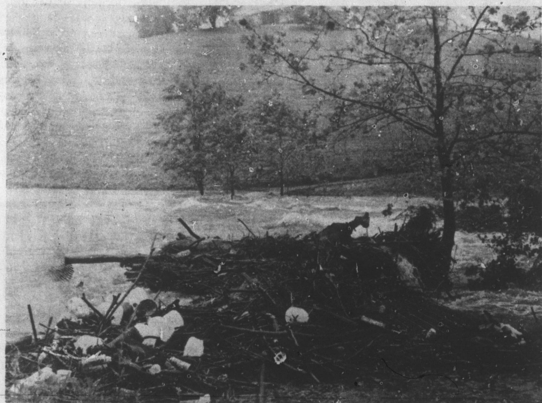
Force Of Rushing Water Caused Debris To Collect In Rivers And Along Banks