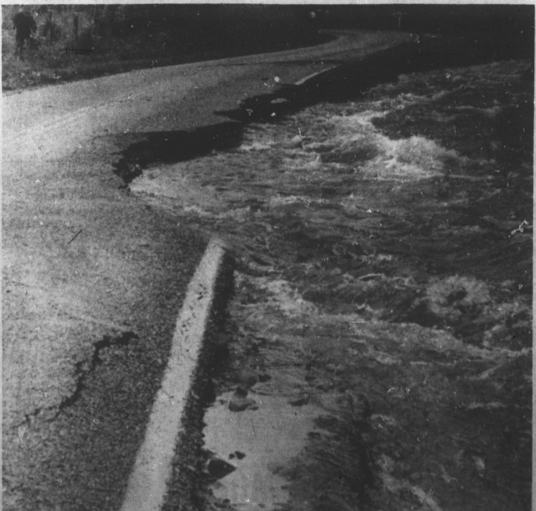
Repairing County Roads Will Be A Costly Undertaking