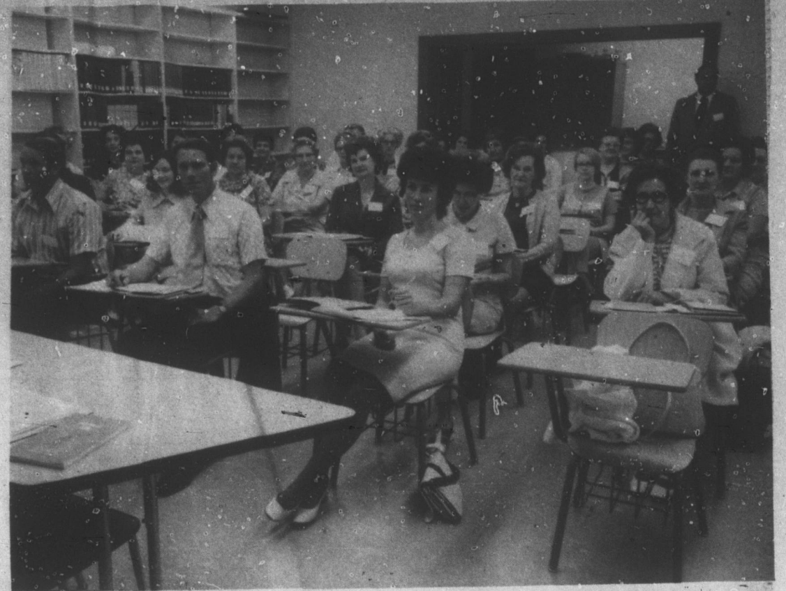
Mayland Technical Institute Articulation Workshop Brought 43 Teachers From Area

Other teachers are enrolled on college campuses working toward certificate renewal.