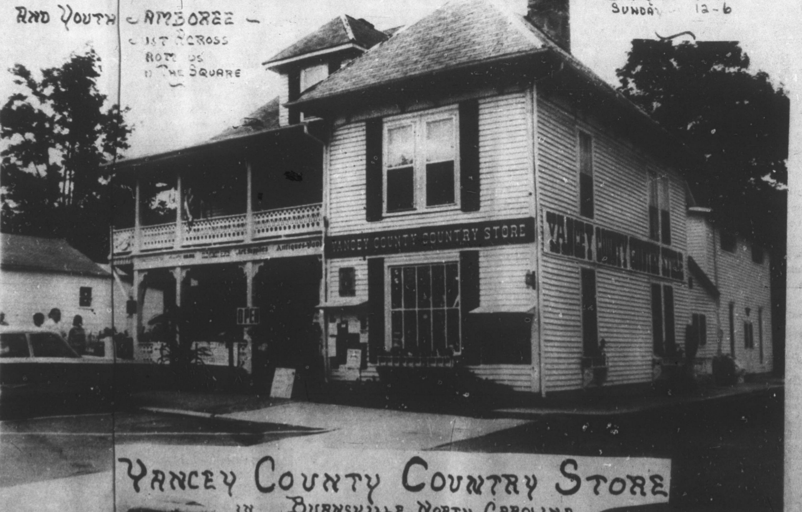
YANCEY COUNTY COUNTRY STORE IN BURNSVILLE, NORTH CAROLINA

OPEN ALL YEAR JULY 9-11 DAILY 9-8 SUNDAY 12-6