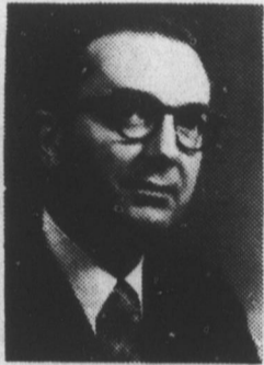
Jesse Helms FOR U.S. Senate