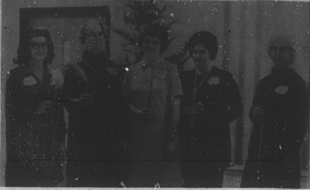
New Officers Installed At Special Achievement Day Service Held On October 31