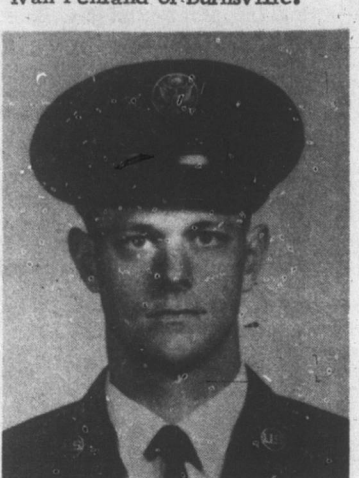
To These Farewell...