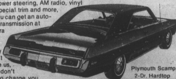
Plymouth Scamp 2-Dr. Hardtop

Order our specially-equipped Scamp with power steering, AM radio, vinyl roof, special trim and more, and you can get an automatic transmission at no extra cost. The factory doesn't charge us, so we don't have to charge you.