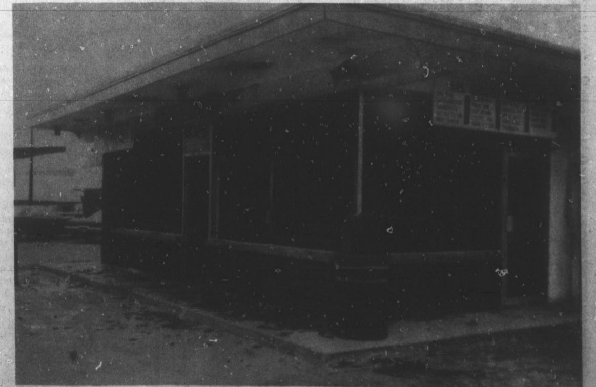
Li'l Smokeys Damaged By Blaze