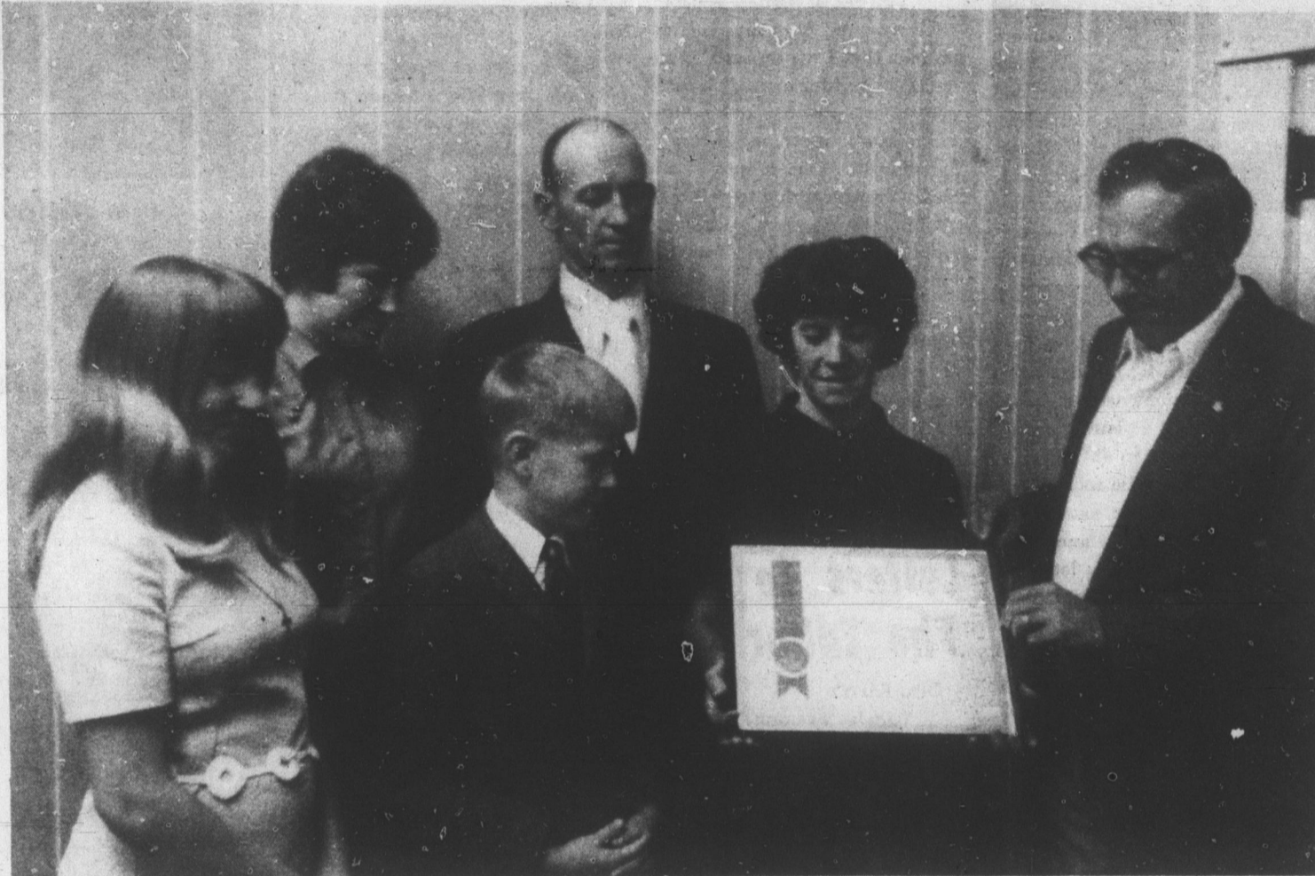
Farm Family Of The Year

Holding further stated that those already having 5 1/2 and 5 3/4 percent savings certificates with First-Citizens will also receive the benefits of the new method of interest calculations effective April 9, 1973.