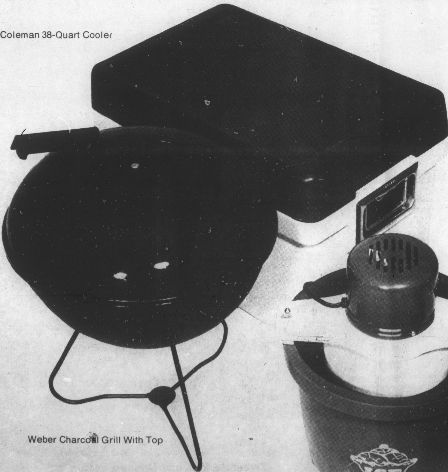
Weber Charcoal Grill With Top