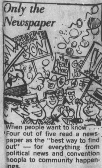
When people want to know... Four out of five read a newspaper as the "best way to find out" — for everything from political news and convention hoopla to community happenings.